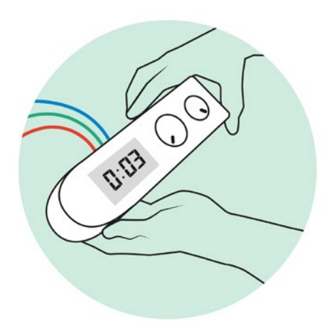
Electrical tests being carried out

Periodic inspection and testing of existing electrical installations should only be carried out by electrically skilled persons competent in such work